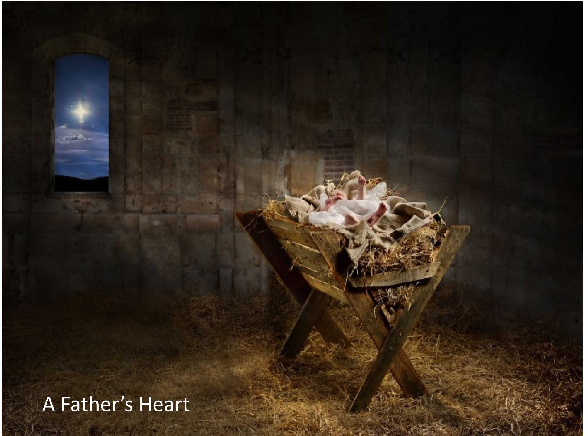
A Father's Heart